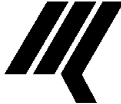
CR Quality Services, Inc.